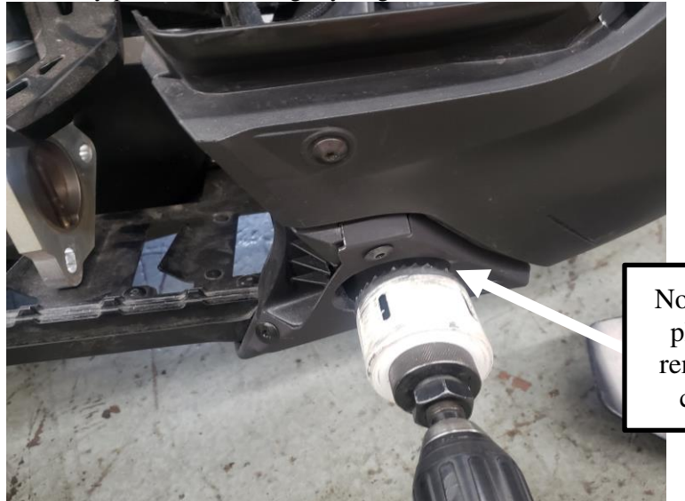
Note: Mark hole with plate in place, then remove plate so hole can be cut larger.

4. Prepare belly pan: Hold up belly pan plate to lower corner of the belly pan and mark the outlet circle and rivet locations. Use a hole saw or appropriate tool to cut out the material for the center and a 3/16" drill bit for the rivet holes. Note: The hole in the belly pan should be slightly larger than the center hole of the plate for heat clearance.