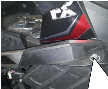
Unscrew these hood pins from both sides.