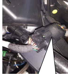
Unclip the main harness plug