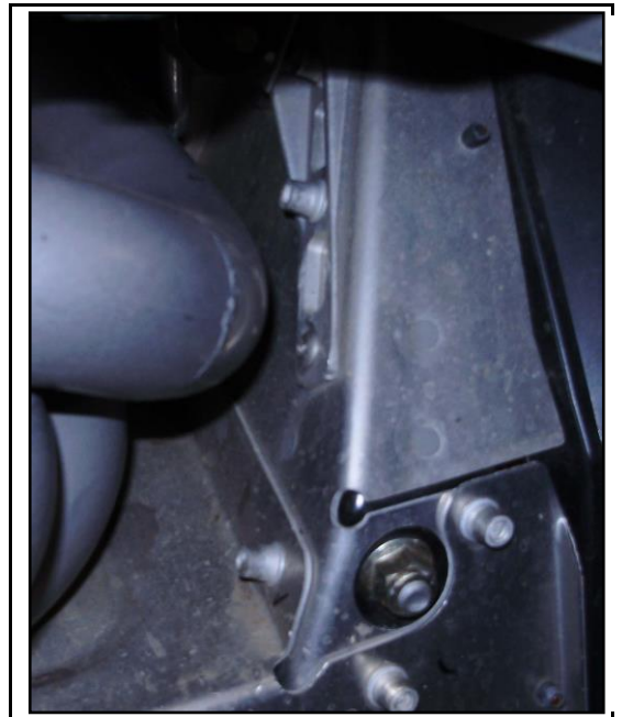
(Re-install the button head screw as shown)

Jetting Requirements: No Jetting Required