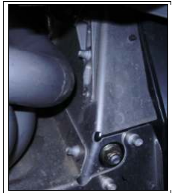
(Re-install the button head screw as shown)

Jetting Requirements: No Jetting Required