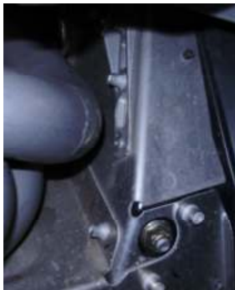
Re-install the button head screw as shown

Be sure the Straightline single has no manufacture defects. If the pipe has been run/used there are no warrantees for fitment.