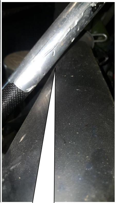
Be sure all clearances have enough room to clear chassis components. Typically a 1/4" will suffice.