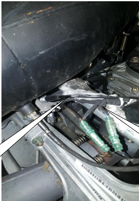
Zip tie cable down loosely, then cover with supplied heat tape